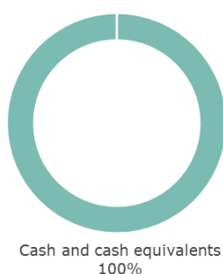
Target investment mix 6