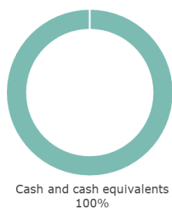
Target investment mix 6