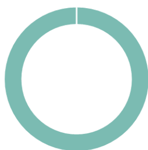
Cash and cash equivalents 100%